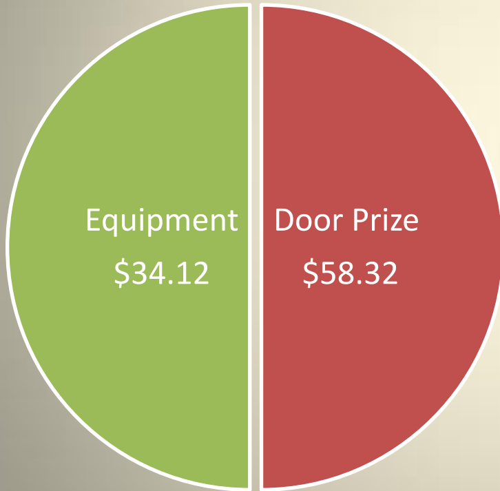
Cash on Hand