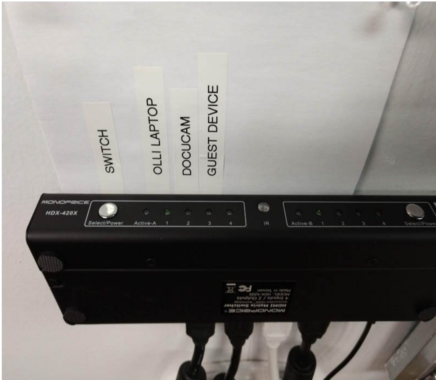
TA1 Video Selector Switch for images routed to the projector from the podium area.