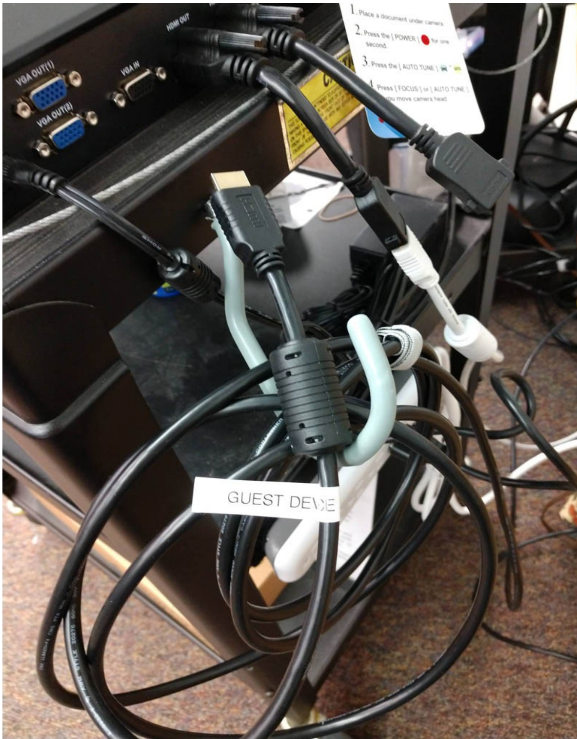
Guest Laptop / Device HDMI cable, hanging on hook on rear of Docucam Cart.